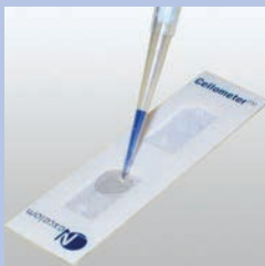
Pipette 20 µl of Sample